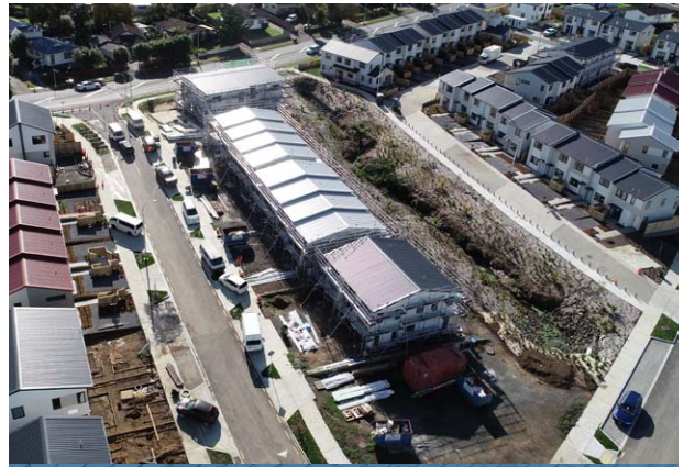
Aerial picture of Wattle Park during closing stages of the development

Roine agrees adding that “Stable, adequate housing means that kids don’t go to 10 different schools before they turn 10, it means they can keep the same set of friends, they are grounded, have memories and long-term relationships, and that they can stay connected to their local communities.”