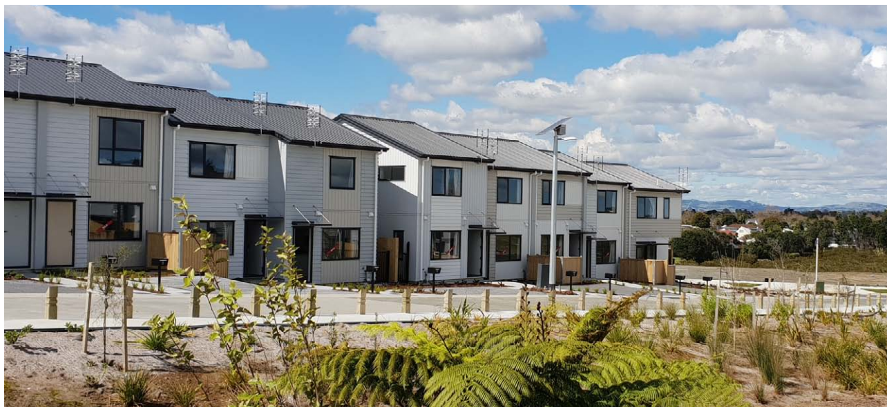
Some of the new Community Housing Provider homes at Wattle Park

A new Auckland housing development is an example of how private interests can work with public good to help get New Zealanders from all walks of life into warm, safe, secure homes.